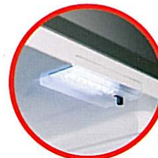
Intelligent led light