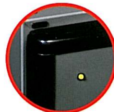
Door open dedector (Optional)