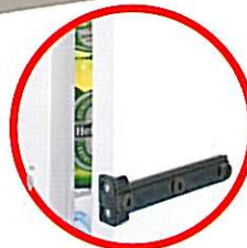
Sliding hinge fixture for built-in models